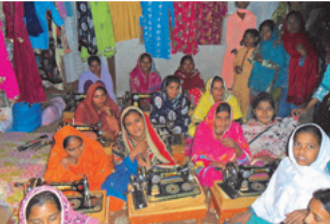
Women at sewing machines in the fifth center. Some items they sewed are on the back wall.

The GBM PAK sewing centers are strictly Christian in daily devotions, but they are not restricted only to Christian women. All centers are open to include Muslim women or those of other faiths. Some of the centers already have Muslim students. Each day, there are prayers to Jesus and usually a reading from the Bible. Sometimes this is done by a pastor because girls in the villages, even trainers, may be illiterate.