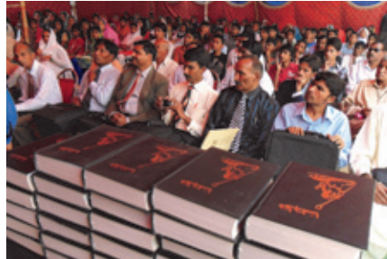
About 200 Christian leaders and workers are attentive to the teaching. The books are the Shepherd's Staff , leadership manuals given by World MAP for the lead pastors.

Some of the most significant events to me were the times of encouraging the saints in various churches and speaking into the lives of Christian leaders. These are the ones whom God has raised up in that culture to take the light of the gospel of Jesus Christ to