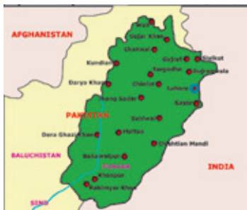
Several of the larger districts with sewing centers can be seen on the map of the Punjab

Many of the revival meetings were guarded by security personnel with various weapons, shot-guns or machine guns. On some occasions, there were also policemen present who made sure that there was no conflict between Muslims and