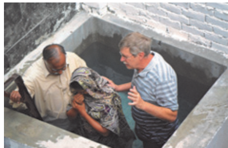
We had a special time of baptism at Church of Faith in Lahore for people who had given their lives to Christ.

When you find your self in a storm, remember that Jesus is in the boat. Let His lack of anxiousness give you courage. He is your peace! Focus on Jesus and the problems of life will fade like a shadow in His light. He loves you and He cares for you.