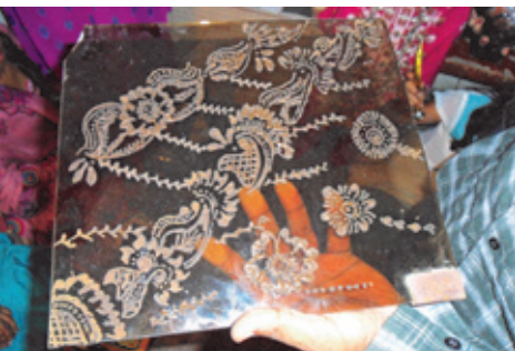
Students practice creating hand print patterns on a piece of glass. These hand prints are popular in the Middle East.

The training centers will now provide a one-year certificate and a two-year diploma.