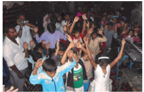
Children and adults stand and lift their hands to accept Jesus as Lord and Savior

Conversely, In Pakistan, it has been documented that Christians convert to Islam because of threats, harassment, and intimidation.