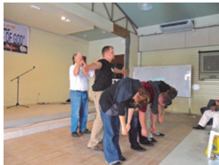
Five of our team doing a the drama Alive Again at a pastor's conference.