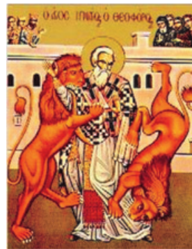
Ignatius of Antioch C. 30 - 110 AD