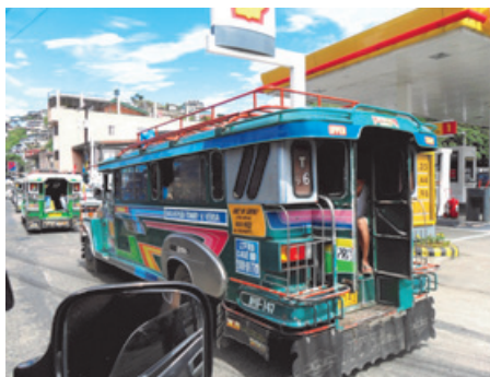
Jeepneys are a standard mode of transportation in the Philippines. Our team took them many times.