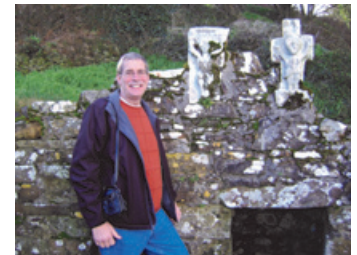
I am standing in front of Saint Declan's chapel in Ardmore.