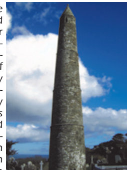
Round tower at Ardmore.