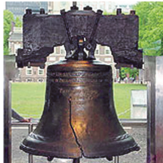
The Liberty Bell is on display in Philadelphia at the Liberty Bell Center across from Independence Hall

Washington's view was widely held, as evidenced by the fact that most, if not all, colonies required elected officials to sign a proclamation stating that they were Christians who believed in the Bible.